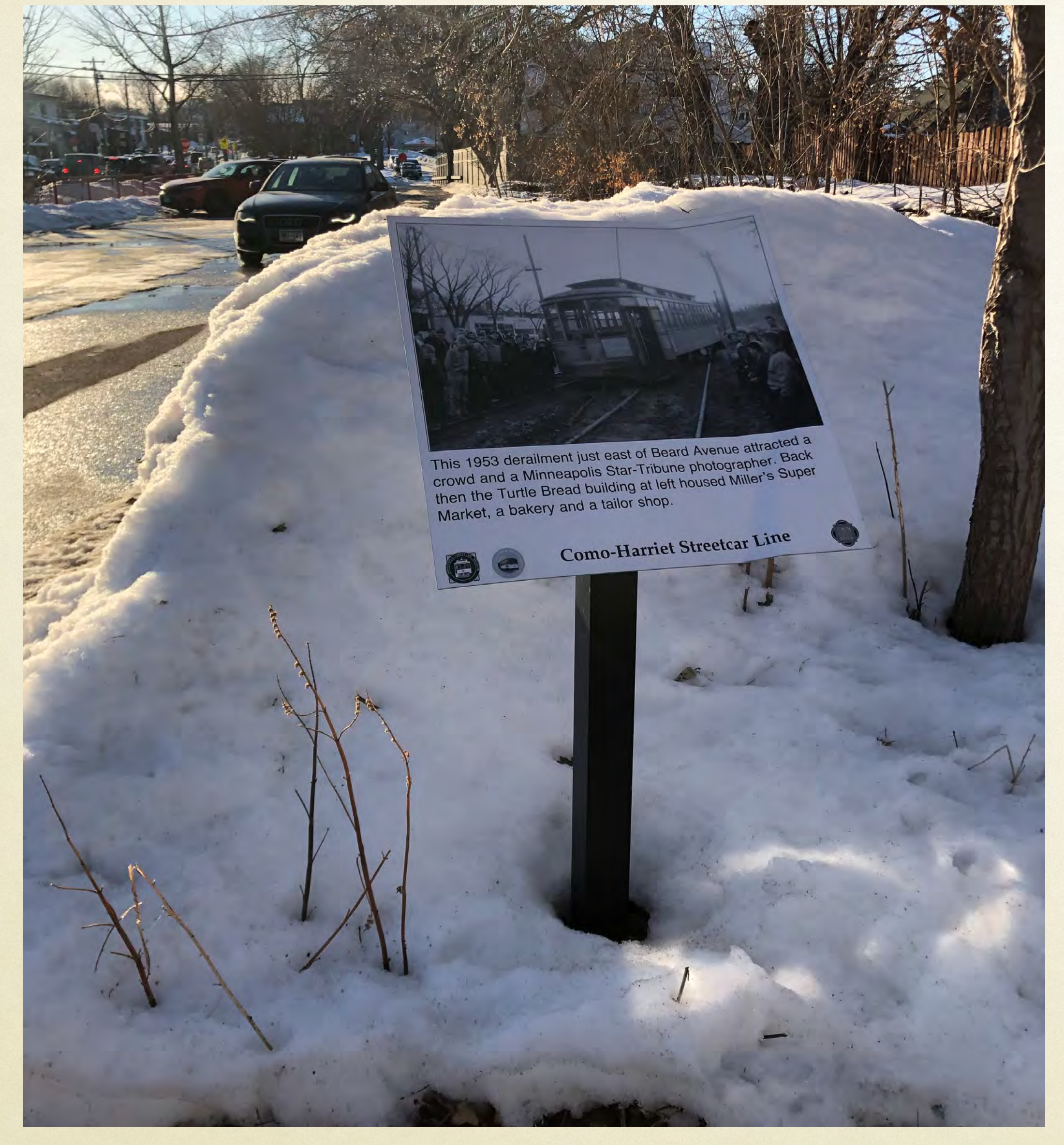
Mounted at a 45 degree angle on square steel channel posts set in concrete